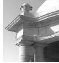
Jahangir Kothari Parade

Origins: The dome seems to have developed as roofing for circular mud-brick huts in ancient Mesopotamia about 6000 years ago. In the 14th century B.C. the Mycenaean Greeks built tombs roofed with steep corbeled domes in the shape of pointed beehives (tholos tombs). Otherwise, the dome was not important in ancient Greek architecture. The Romans developed the masonry dome in its purest form, culminating in a temple built by the emperor Hadrian. Set on a massive circular drum the coffered dome forms a perfect hemisphere on the interior, with a large oculus (eye) in its center to admit light.